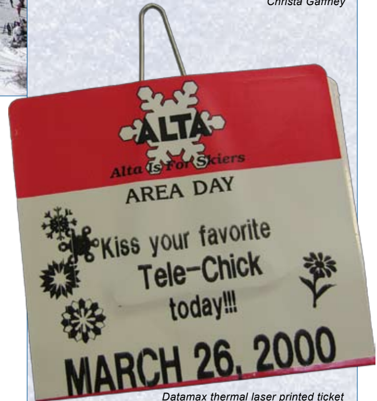
Datamax thermal laser printed ticket

For more information on our environment programs and how you can participate, visit us online: alta.com