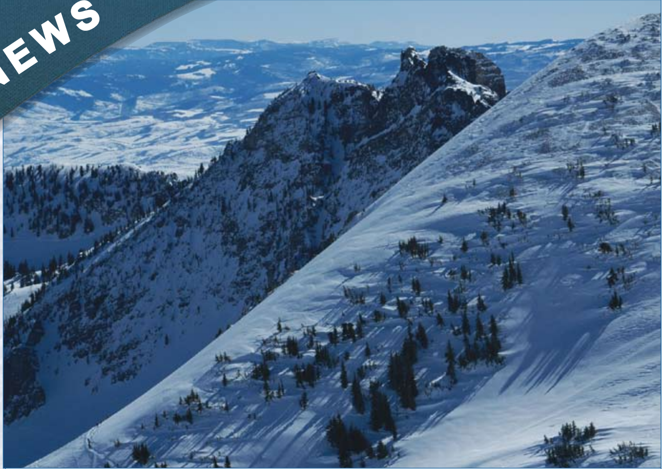
Devil's Castle from the top of Mt. Baldy