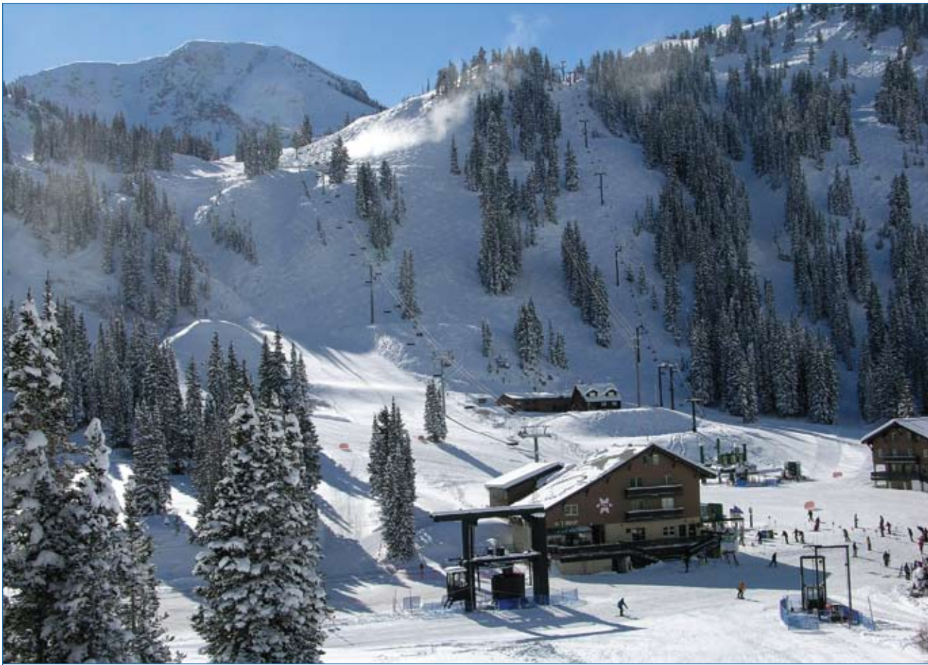
The Wildcat Ticket Office