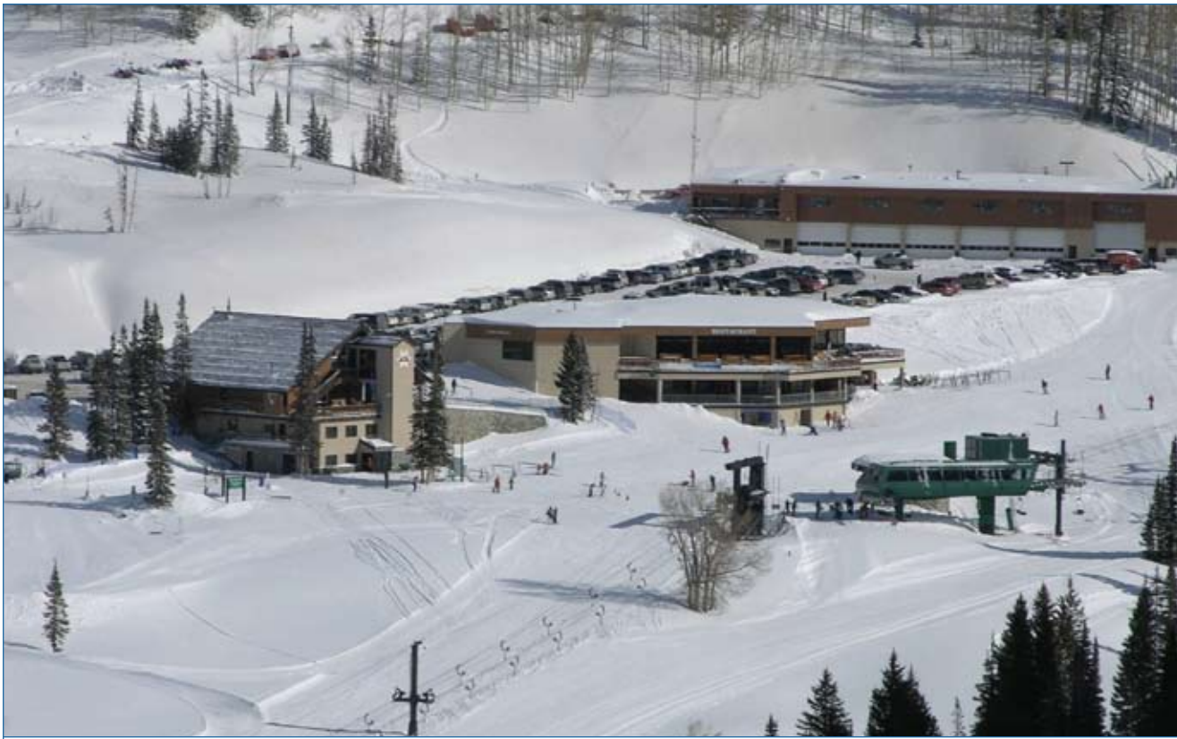
The Albion Base