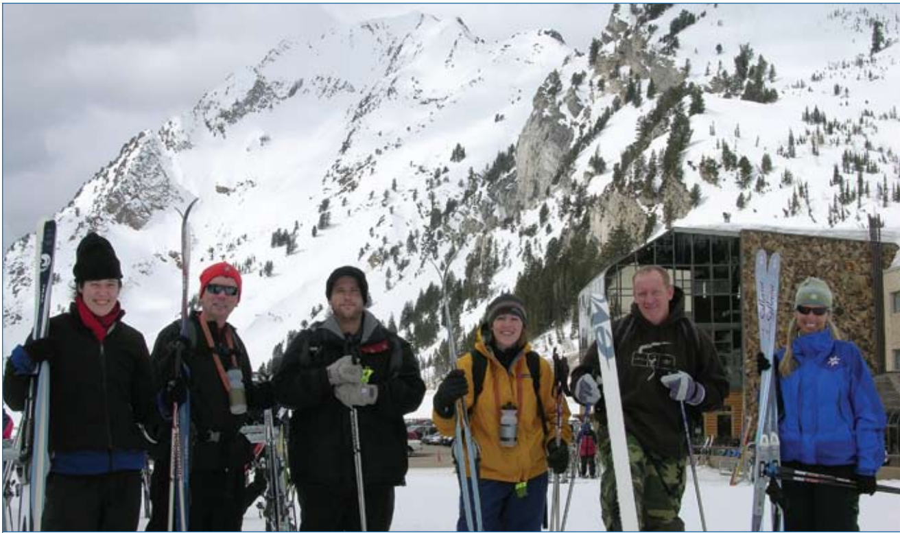
SPLORE Vets at Alta