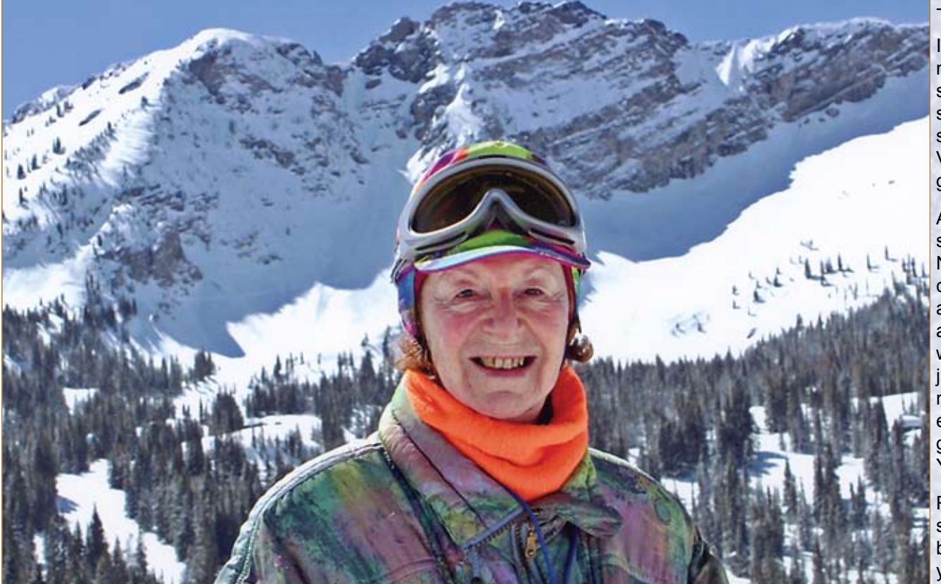
-continued from page 9