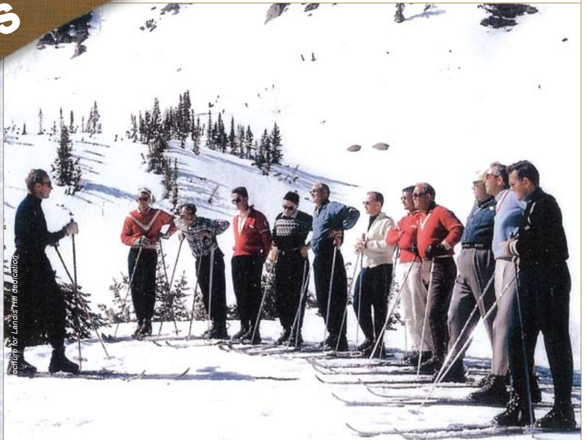
1958 National Ski Association "on-snow certification conference" at Alta